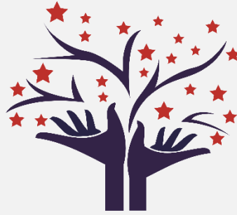
OUR NEW LOGO

Extramural activities began this month. Students may participate in as many activities as they wish. Please guide your child with their selection.